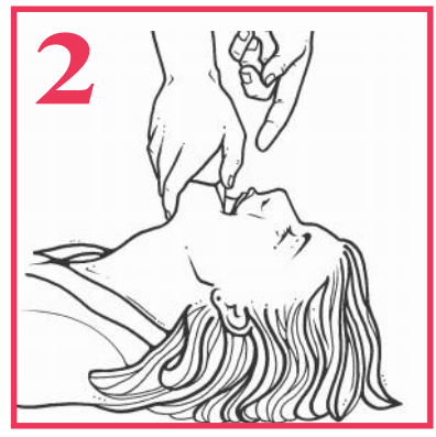
Open the airway and check the mouth for objects. Remove the obstructing object only if you see it.